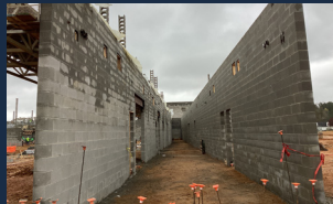
Corridor walls - classrooms