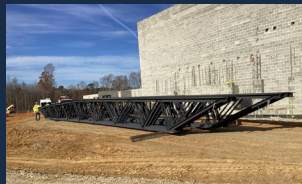
Bar joist delivery (Area D - Gym)