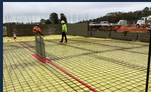
Band room slab prep (Area A)