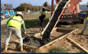
Concrete pad - mockup