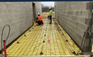
Slab prep - corridor walls (A & B)