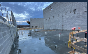
Area D concrete slab pour